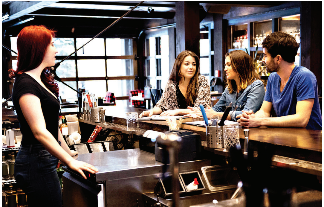
A bartender talks with customers in a bar setting. Bartenders are often the first person members speak to when they come into the Social Quarters.