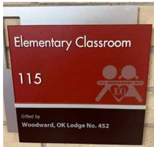
On the wall of classroom number 115, which is a music room, is a plaque that reads "Gifted by Woodward Moose Lodge No. 452".

On the wall of classroom number 115, which is a music room, was a plaque that read "Gifted by Woodward Moose Lodge No. 452"!