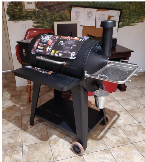
This Pit Boss Sportsman 820 SP Wood Pellet Grill and Smoker will be raffled on October 1.

Come visit with me. I would love to see you.