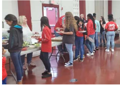
OSKMA Rib Feed above and Homecoming Soccer left