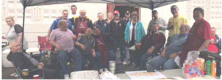
Members of the Oklahoma Southern Kanas Moose Association and some friends from the Pennsylvania Moose Association take a break after cooking ribs for 5 residences at Mooseheart.