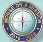
Lodge & Chapter Pin

Moose On A Mission lapel pins are presented by your Lodge, Chapter or Moose Legion to members that sponsor their first member during this campaign.